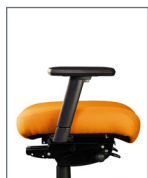
3 Arm 3" Adjustable