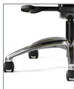
B6 26" Polished Aluminum