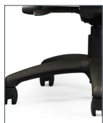
B0 Standard 26" Black