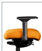
9 Arm 5-way Adjustable