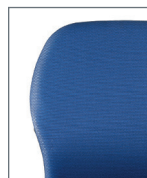
S1 or S2 Grade C or 1 (S1) Grade 2 (S2)