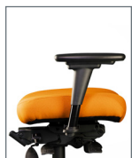
2 Arm Lateral Sliding