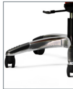
B9 28" Chrome