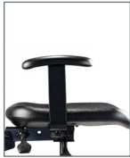
A2 T arms