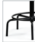
B20 25" Spider Ring w/Glides