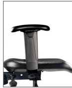
A6 4" Adjustable Extended Height