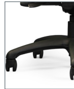
B12 28" Black