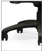
B0 26" Black