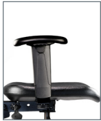
A0 4" Adjustable