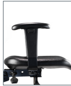
A3 3" Adjustable