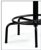
B3 26" Spider Ring w/Glides