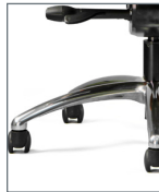
B6 26" Polished Aluminum