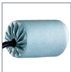
2 AbRest™ Upholstered