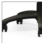
B0 Standard 26" Black