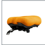
6 Seat Medium Seat, Moderate Contour