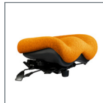
7 Seat Medium Seat, Deep Contour