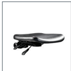
5 Seat Urethane Seat