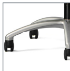
B8 27" Brushed Aluminum