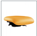
3 Seat Medium Seat