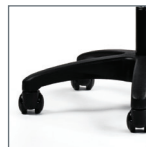
B22 22" black